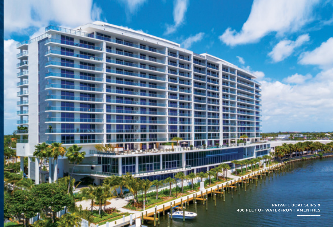
PRIVATE BOAT SLIPS & 400 FEET OF WATERFRONT AMENITIES