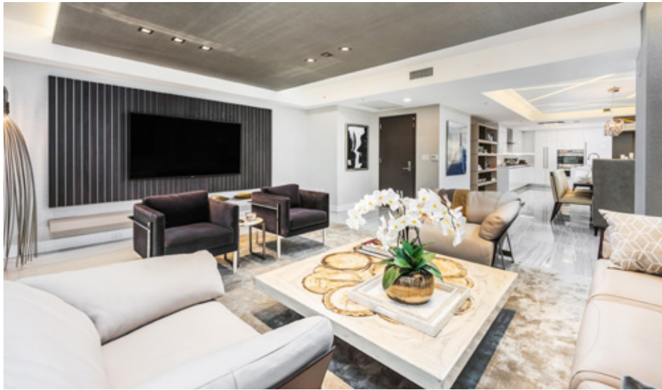
Above: Modern interiors embrace ample space for open living and dining areas.