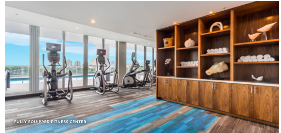
FULLY-EQUIPPED FITNESS CENTER