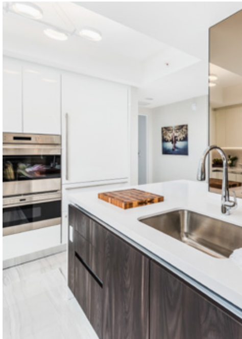
Below: Kitchens feature a chef-worthy suite of Wolf® and SubZero® appliances. Inspiring views are maximized with sweeping Intracoastal and Atlantic panoramas. Finished in soothing, grey porcelain and glittering chrome fixtures, master bath wet rooms become spa-like sanctuaries.