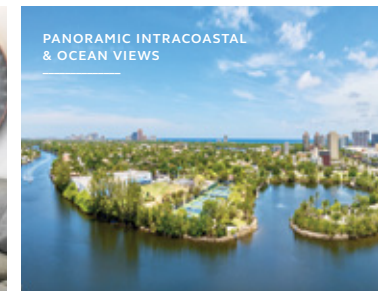
PANORAMIC INTRACOASTAL & OCEAN VIEWS