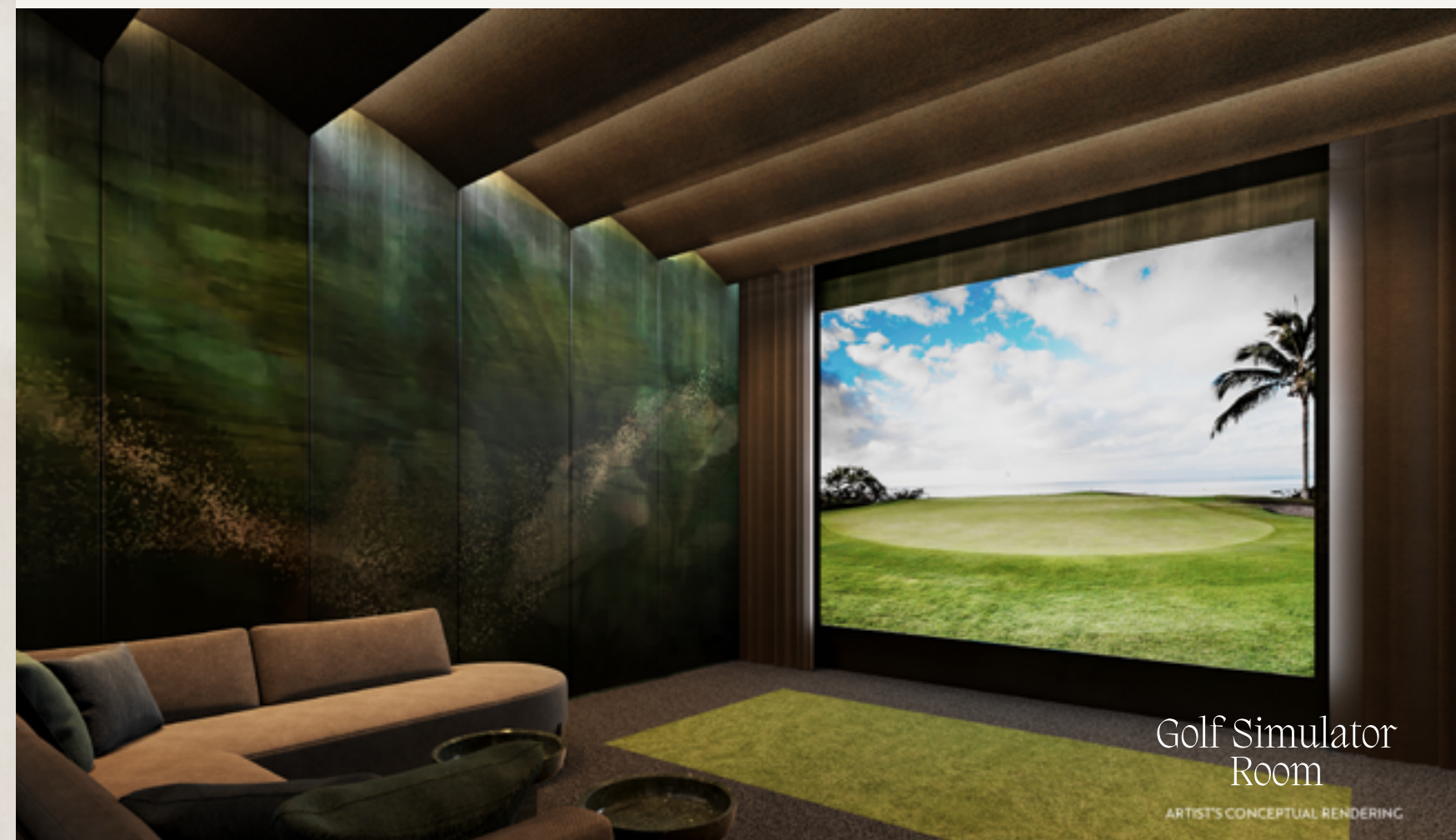
Golf Simulator Room